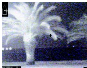
Ultra Low Light Camera