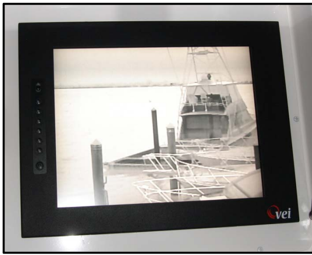
Atlas Imager as displayed on optional VEI Monitor