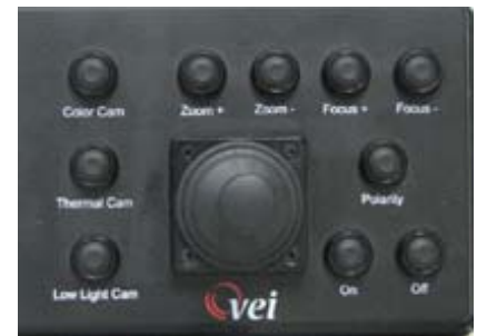
Outdoor Waterproof Controller