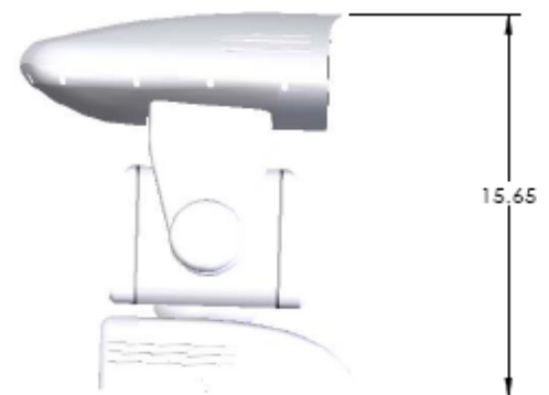
Dimensions in Inches